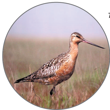
The Bar-tailed Godwit breeds in Alaska and “winters” some 7,150 miles away in New Zealand—and gets there by flying non-stop for up to 9 days.

WHSRN Executive Office P.O. Box 1770 Manomet, MA 02345 (508) 224-6521