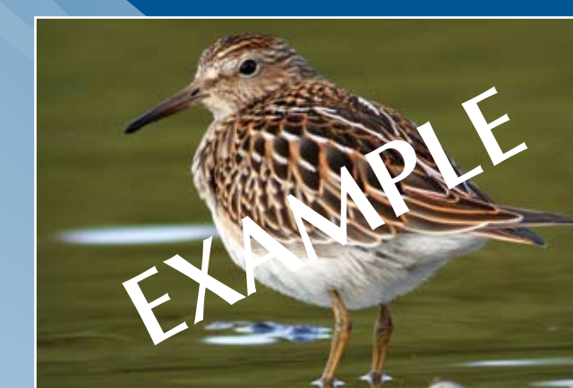
Pectoral Sandpiper ( Calidris melanotos )

2 Provide up to 4 high-resolution (3.5" x 2.25" @ 300 dpi) photos of shorebirds commonly seen at your WHSRN site.