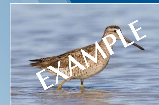
Short-billed Dowitcher ( Limnodromus griseus )