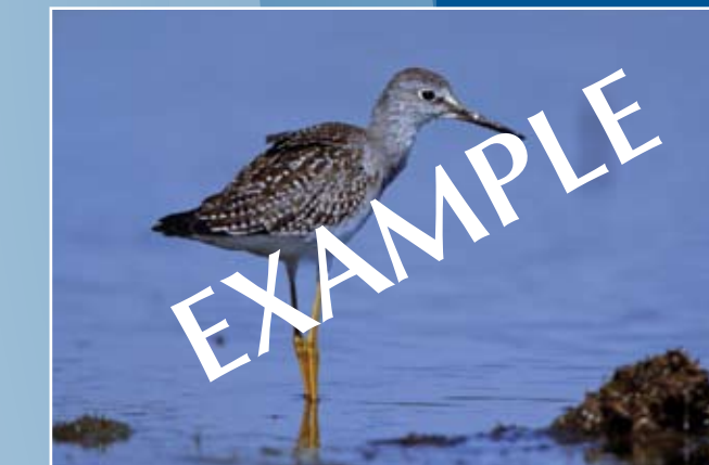
Lesser Yellowlegs ( Tringa flavipes )