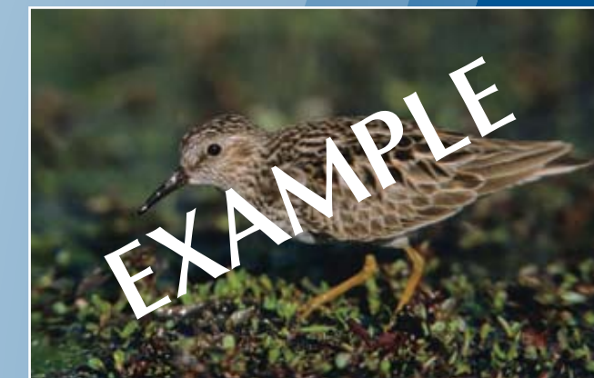
Least Sandpiper ( Calidris minutilla )

Shorebirds 2 you may see at this site include: